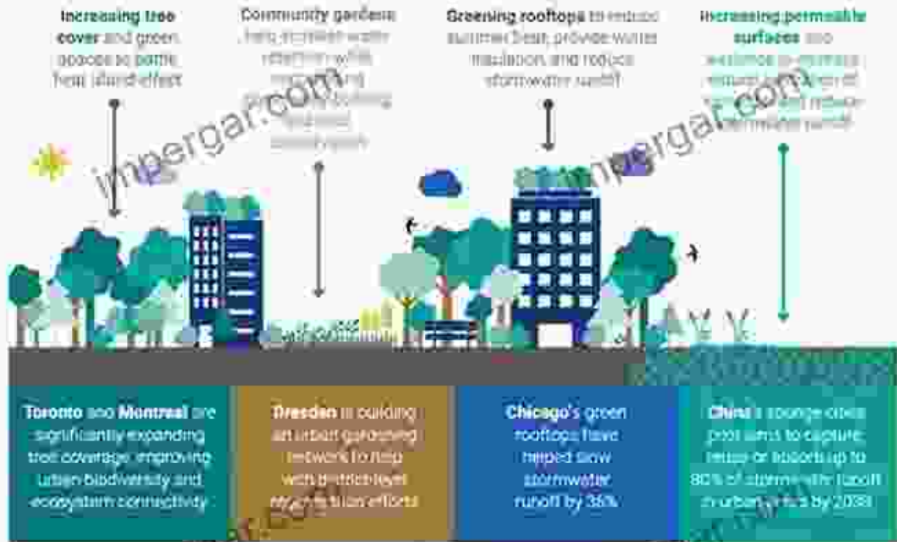
FIGURE 5.2 Urban Climbing with Nature-Based Solutions for Adaptation