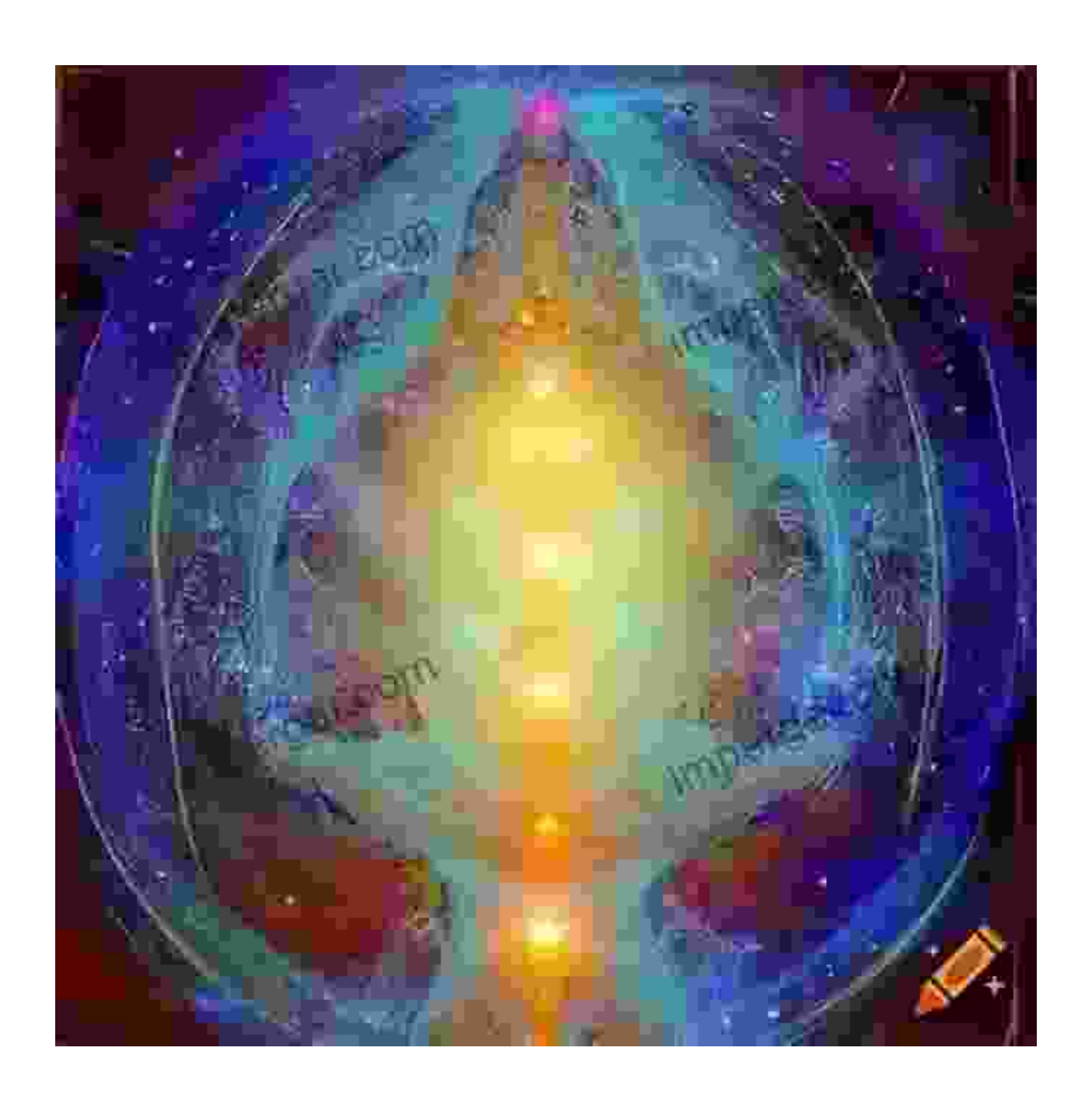
The Transformative Power of Mind-Altering Practices

encounter profound insights about the nature of reality. Through guided meditations and ancient rituals, [Author's Name] explores the potential for achieving cosmic consciousness—a state of union with the universe's infinite wisdom.